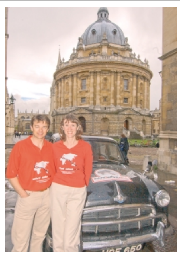
Me and my buddies at the start of the adventure in Oxford, UK.

off to Malaysia, wherever that might be.