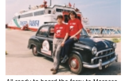
All ready to board the ferry to Morocco.